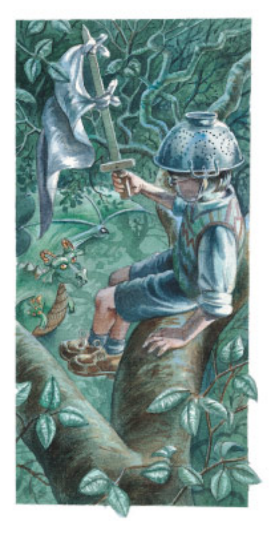
And the final lesson was How to Fight a Knight.