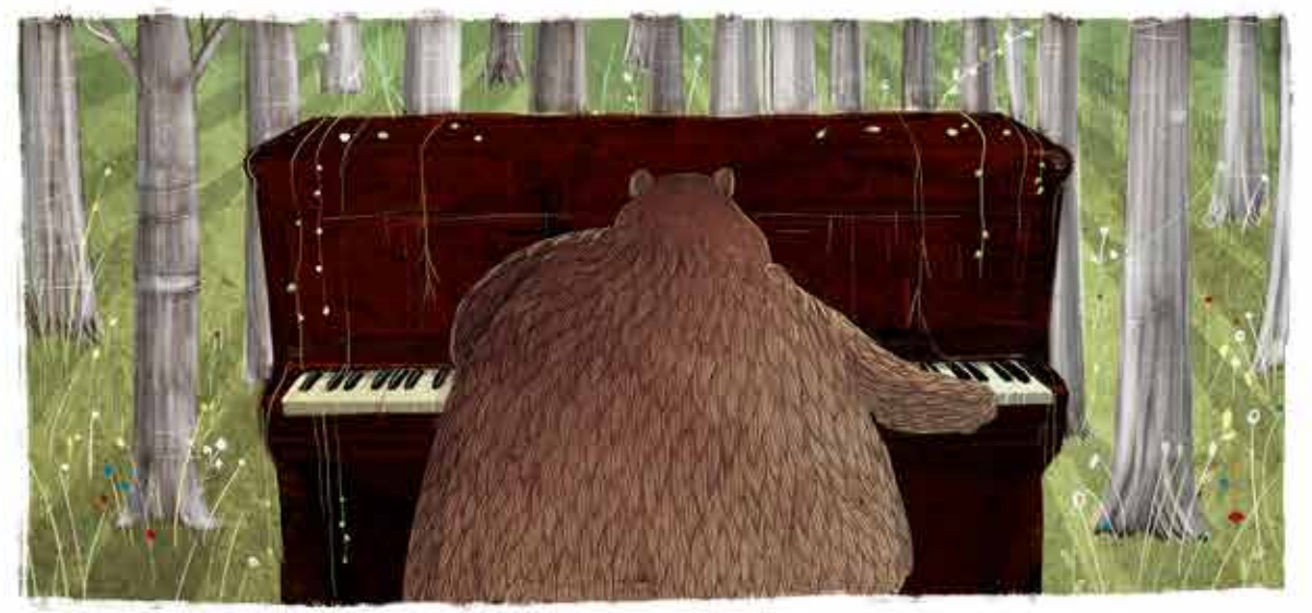
When the bear played, he felt so happy.