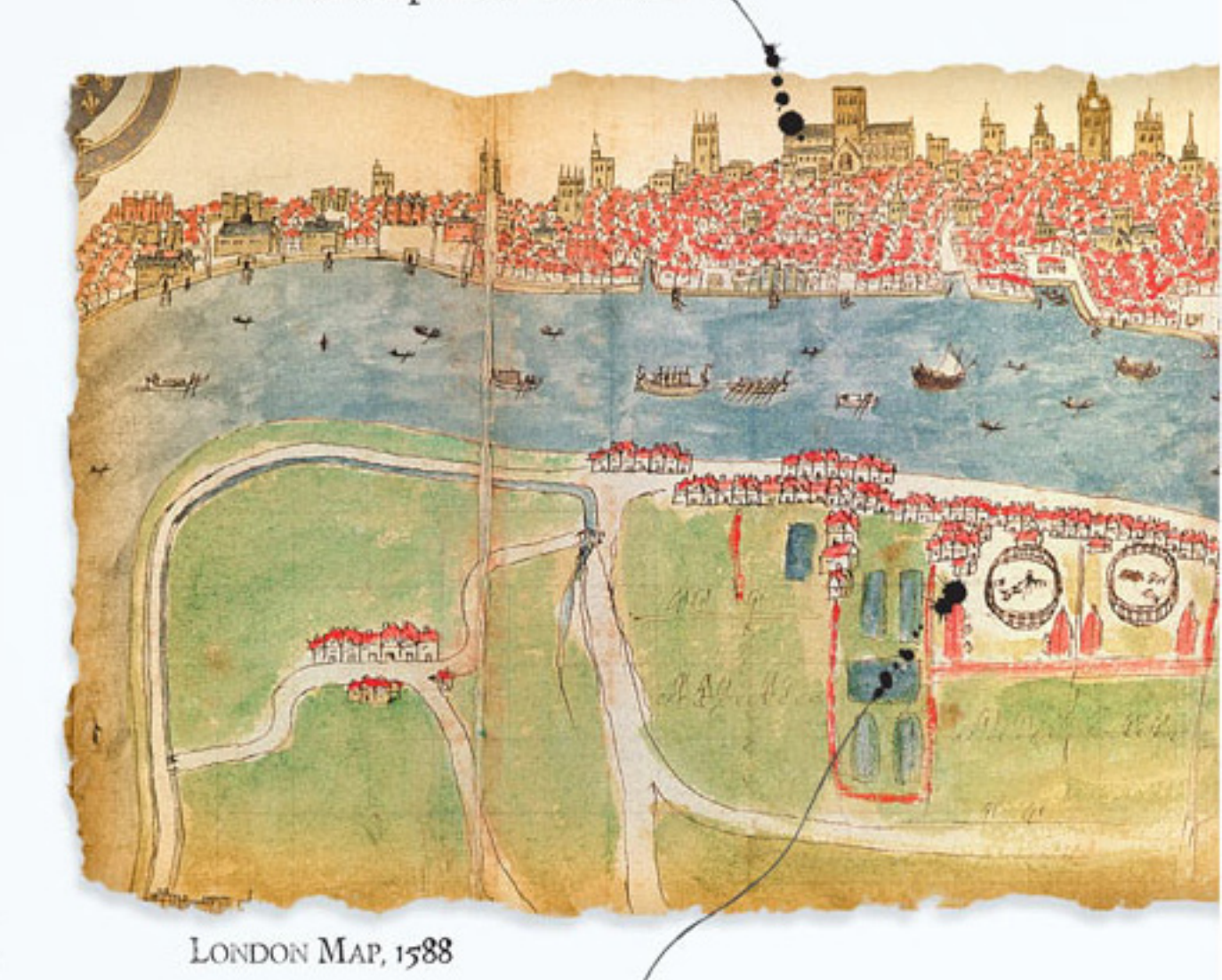
The playhouses changed their shows almost every day – meaning lots of work for an ambitious playwright and actor like Shakespeare.

The tower of Old St Paul's Cathedral towered over the city (until it burned down and was replaced by a domed building, which still stands today). St Paul's churchyard was full of booksellers and printers. It was here that Shakespeare's poems were first printed and sold.