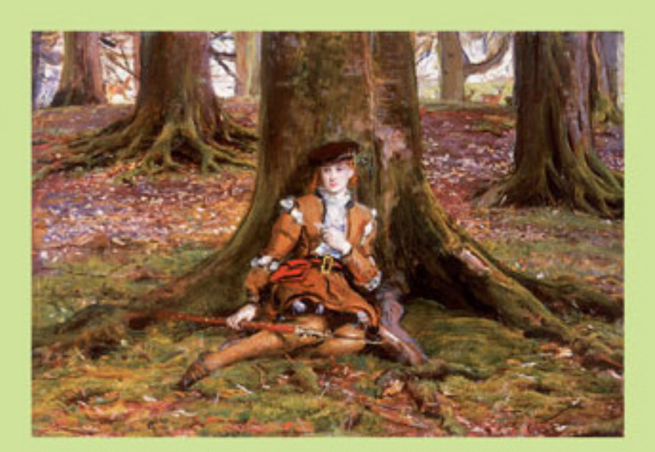
ROSALIND IN THE FOREST, painted about 1868 by John Everett Millais

Under the greenwood tree Who loves to lie with me... Here shall he see No enemy But winter and rough weather. Song from As You Like It