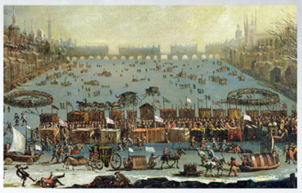
FROST FAIR OF 1683-84, painted in 1685 In very cold weather, if the Thames froze, there would be ice-skating and 'frost fairs' like this, when market stalls and entertainments were set up on the ice. In the distance, you can see the arches of Old London Bridge.