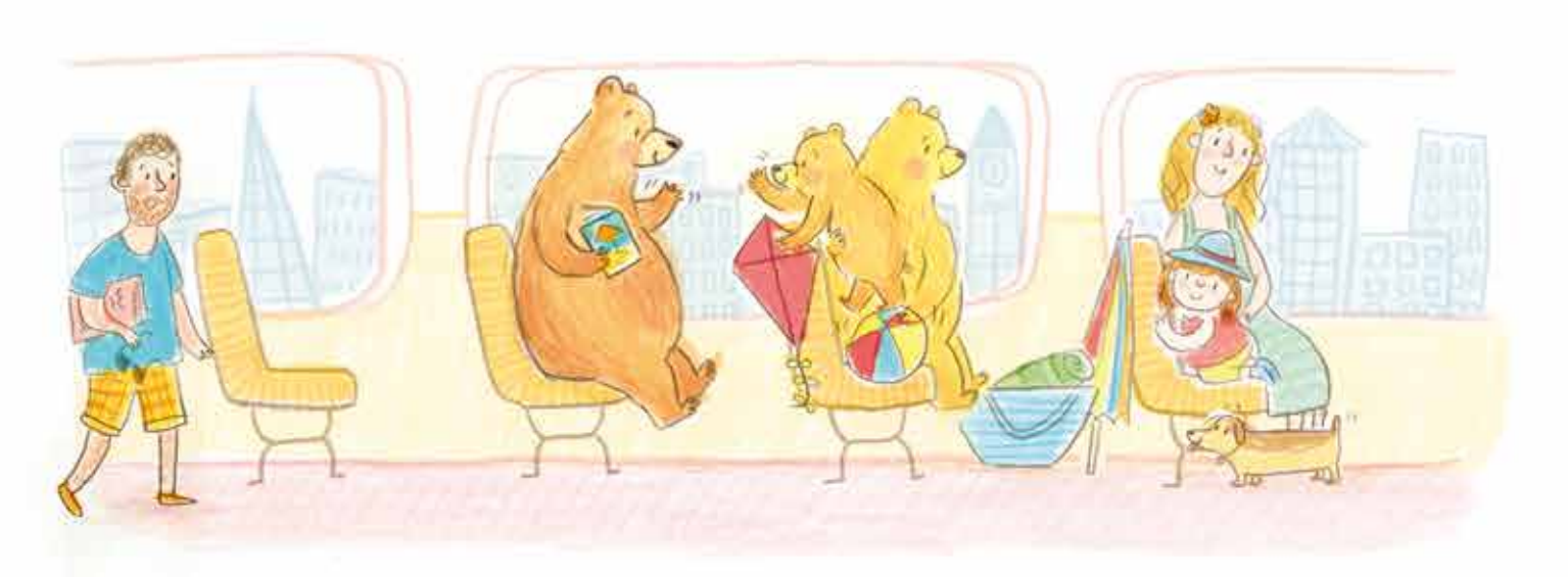
And even though I was excited,