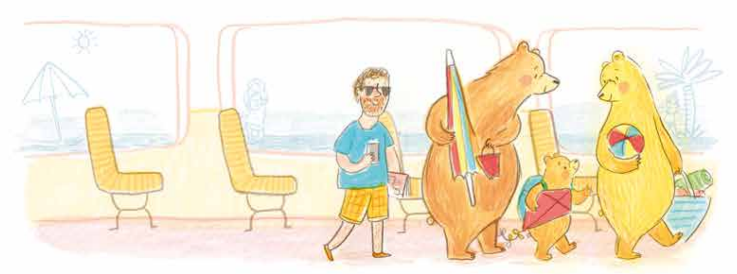
as me, Mum and Dad all went to ...