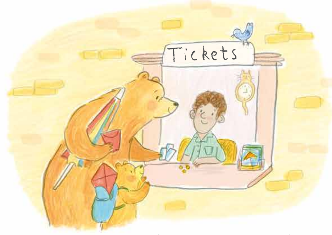
I couldn't wait to fly it!

Dad packed a parasol, Mum rolled a giant towel, and I brought my brand new kite.