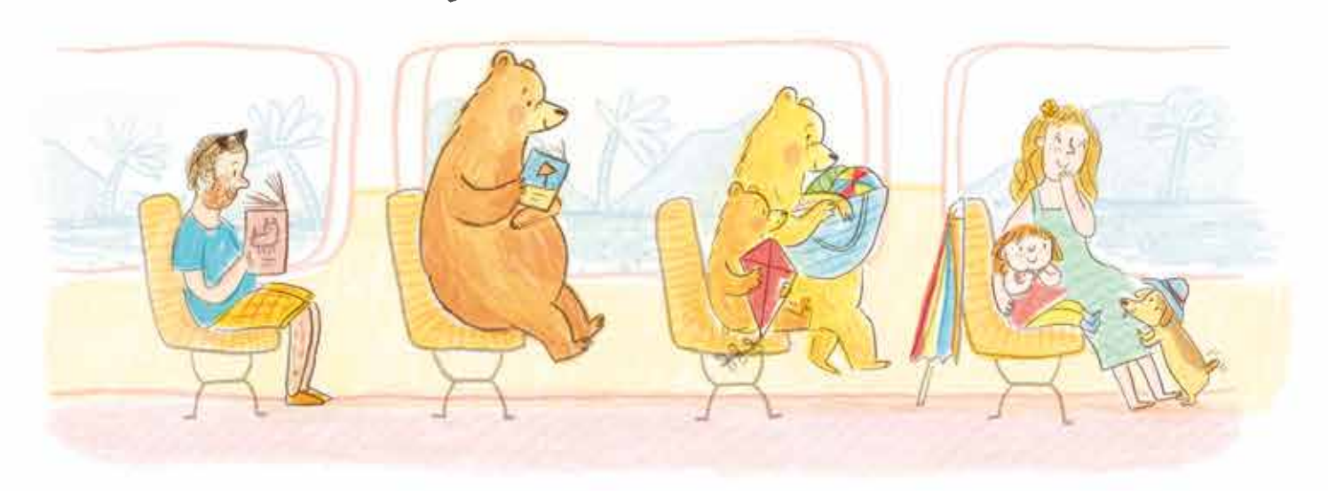
I Sat Still and didn't wriggle,