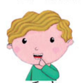
yá chǐ teeth