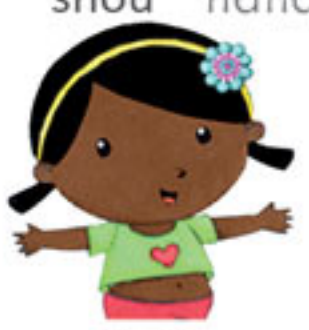
肚子 dù zi tummy