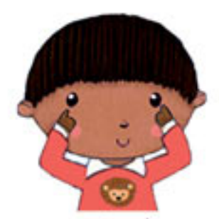
眼睛 yăn jing eyes