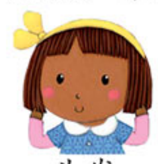
头发 tóu fa hair