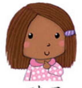
脖子 bó zi neck