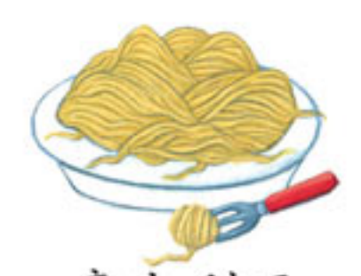
意大利面 yì dà lì miàn pasta