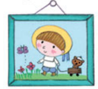
图片 tú piàn picture