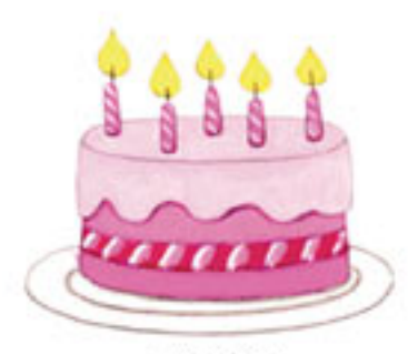
蛋糕 dàn gão cake