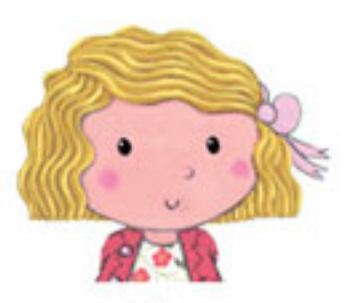
头 tóu head