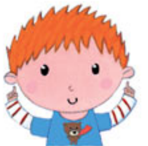
ĕr duo ears