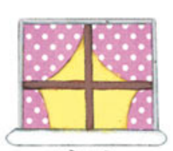
窗户 diàn huà telephone chuāng hu window