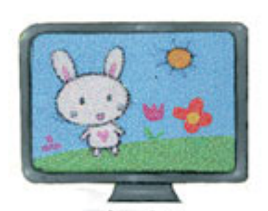
电视 diàn shì television