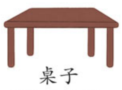
zhuō zi table