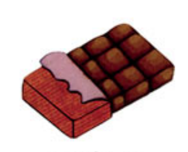
巧克力 qiăo kè lì chocolate