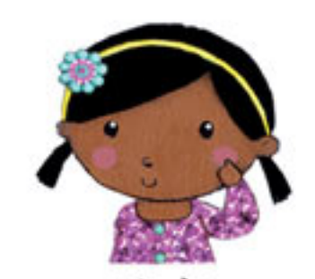
脸颊 liăn jiá cheek