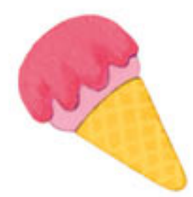
冰淇淋 bīng qí lín ice cream xiāng jiāo banana sān wén zhì sandwich