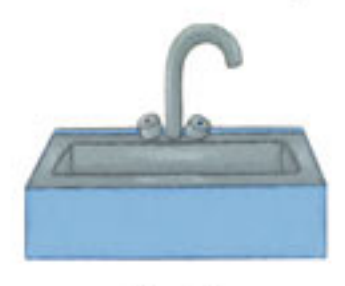
水池 shuĭ chí sink