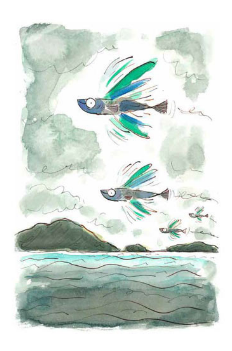
Yes, that's right. Some FISH can FLY. I didn't believe it either until I saw it with my own eyes. To get away from predators, they jump out of the water and let their wing-like fins carry them on air currents.