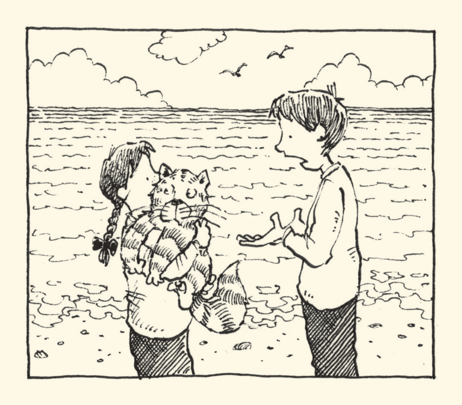
"Just gone, between one wave and another."

Ellie picked up Whiskers and hid her face in her soft, gold fur.