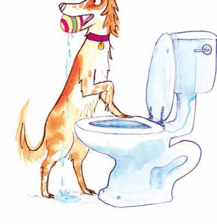
The tumbledown teddy, the bounce-away ball.