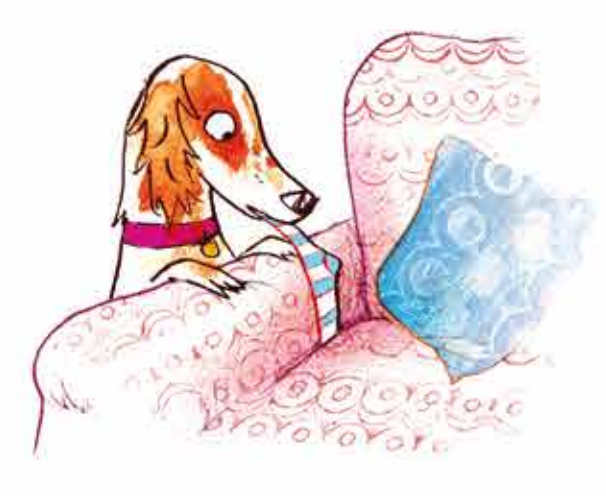
The sock in the sofa, the shoe in the shed,