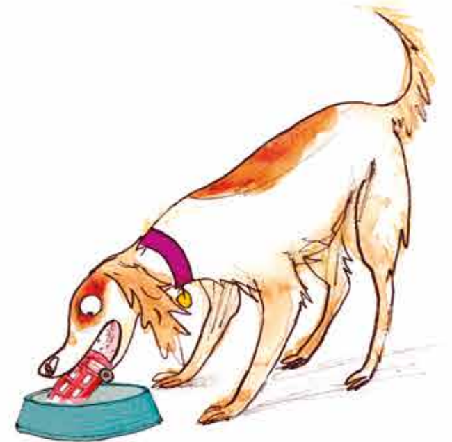
The bus in the bowl and the book in the bed,