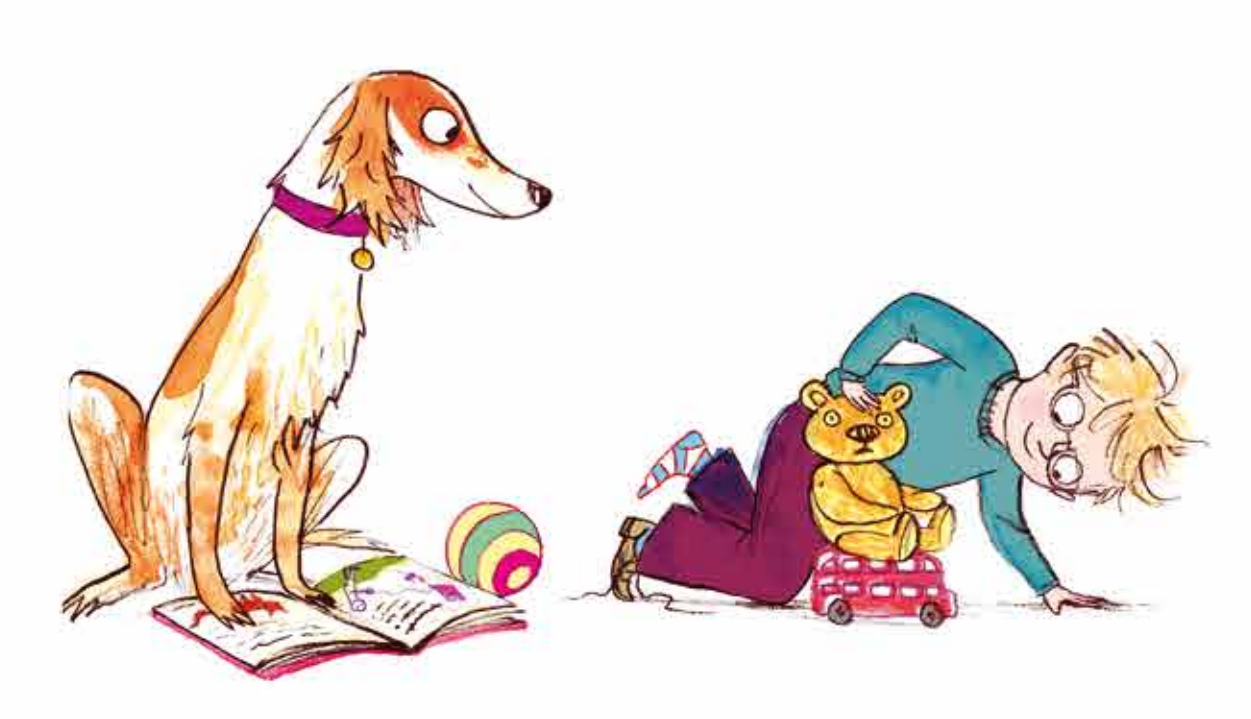
Nell the Detective discovered them all.