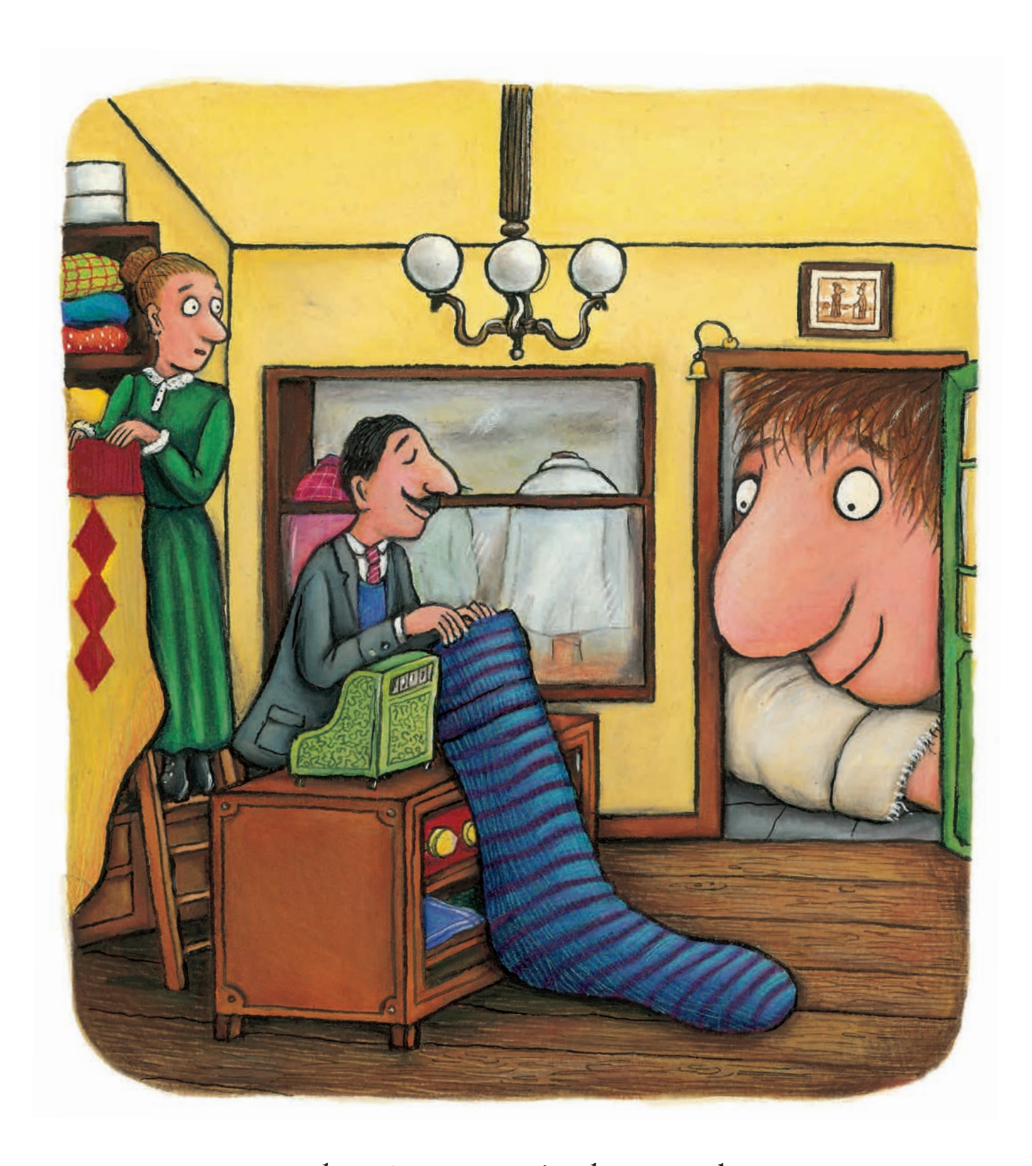
But one day, George noticed a new shop. It was full of smart clothes. So he bought . . .