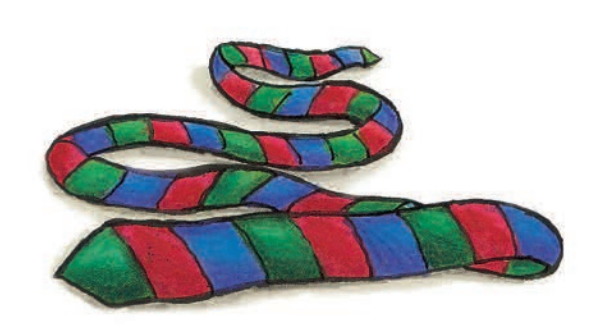
a smart stripy tie,