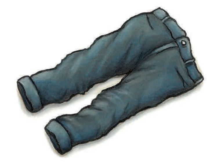
a smart pair of trousers,