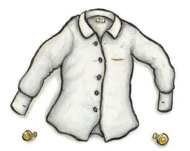
a smart shirt,