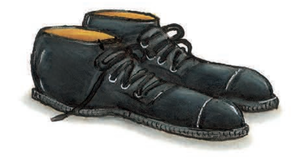
and a pair of smart shiny shoes.

"Now I'm the smartest giant in town," he said proudly.