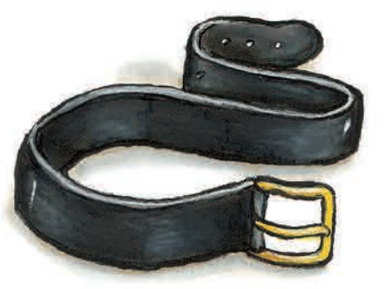
a smart belt,