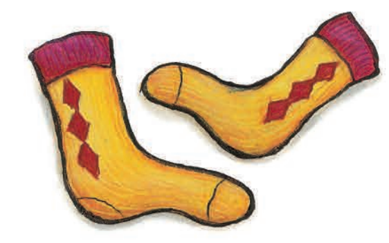
some smart socks with diamonds up the sides,