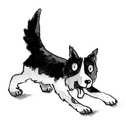
Great Dane? Do you know how much they eat!?