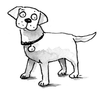
Jack Russell? Too snappy!