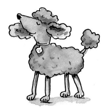
Collie? Too much fur!