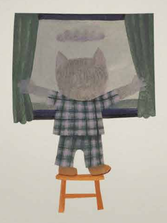
"Why is everything so gray today?"