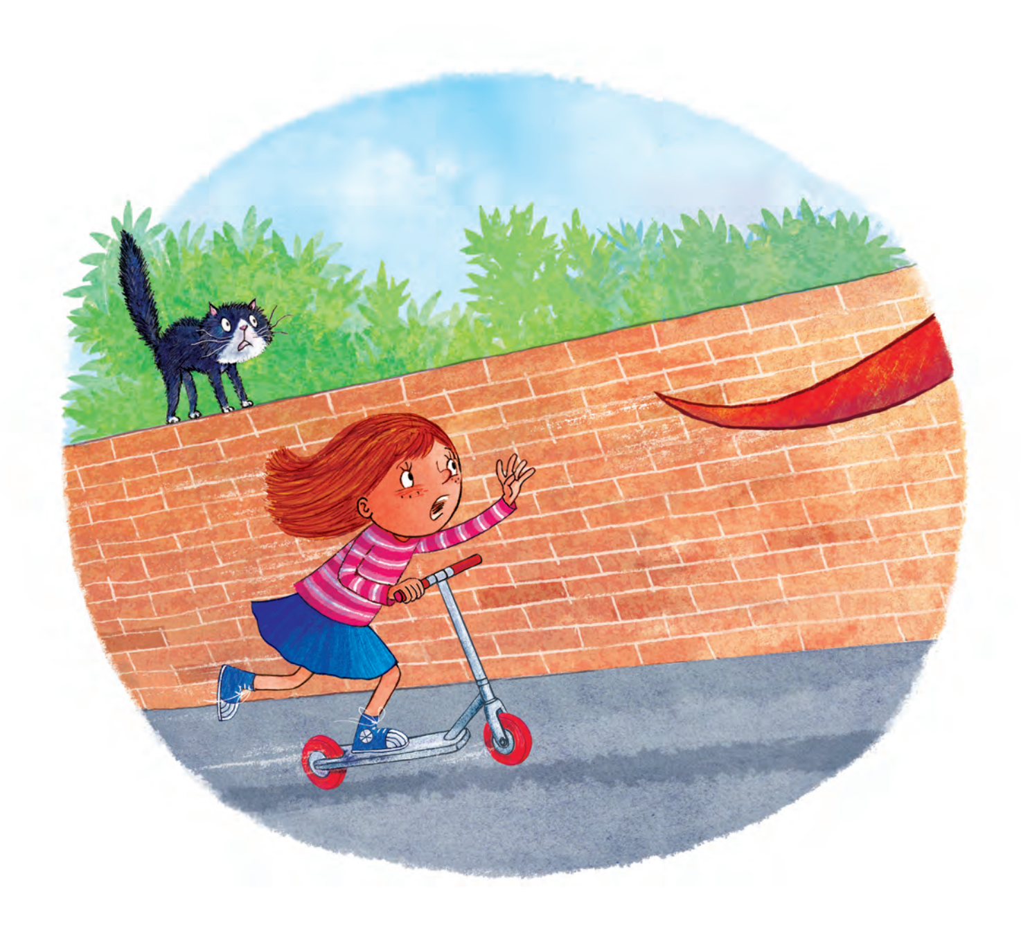
and I WHIZZED off down the street.

That dinosaur was very fast and nimble on its feet. So I jumped right on my scooter . . .