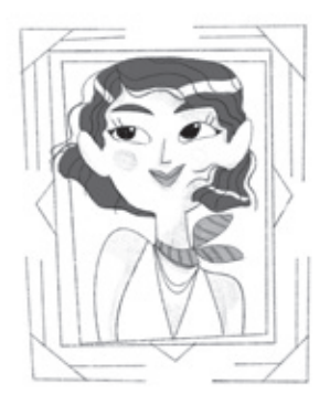
Myrtle Wilson Tom's secret girlfriend