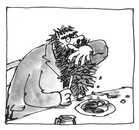
Text copyright (c) Roald Dahl. Courtesy of Penguin Books Ltd

Mr Twit didn't even bother to open his mouth wide when he ate. As a result (and because he never washed) there were always hundreds of bits of old breakfasts and lunches and suppers sticking to the hairs around his face. They weren't big bits, mind you, because he used to wipe those off with the back of his hand or on his sleeve while he was eating. But if you looked closely (not that you'd ever want to) you would see tiny little specks of dried-up scrambled eggs stuck to the hairs, and spinach and tomato ketchup and fish fingers and minced chicken livers and all the other disgusting things Mr Twit liked to eat.