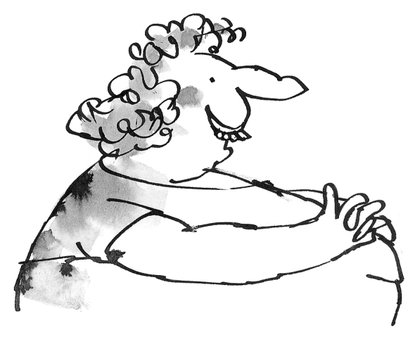
Text copyright (c) Roald Dahl. Courtesy of Penguin Books Ltd

A person who has good thoughts cannot ever be ugly. You can have a wonky nose and a crooked mouth and a double chin and stick-out teeth, but if you have good thoughts they will shine out of your face like sunbeams and you will always look lovely.