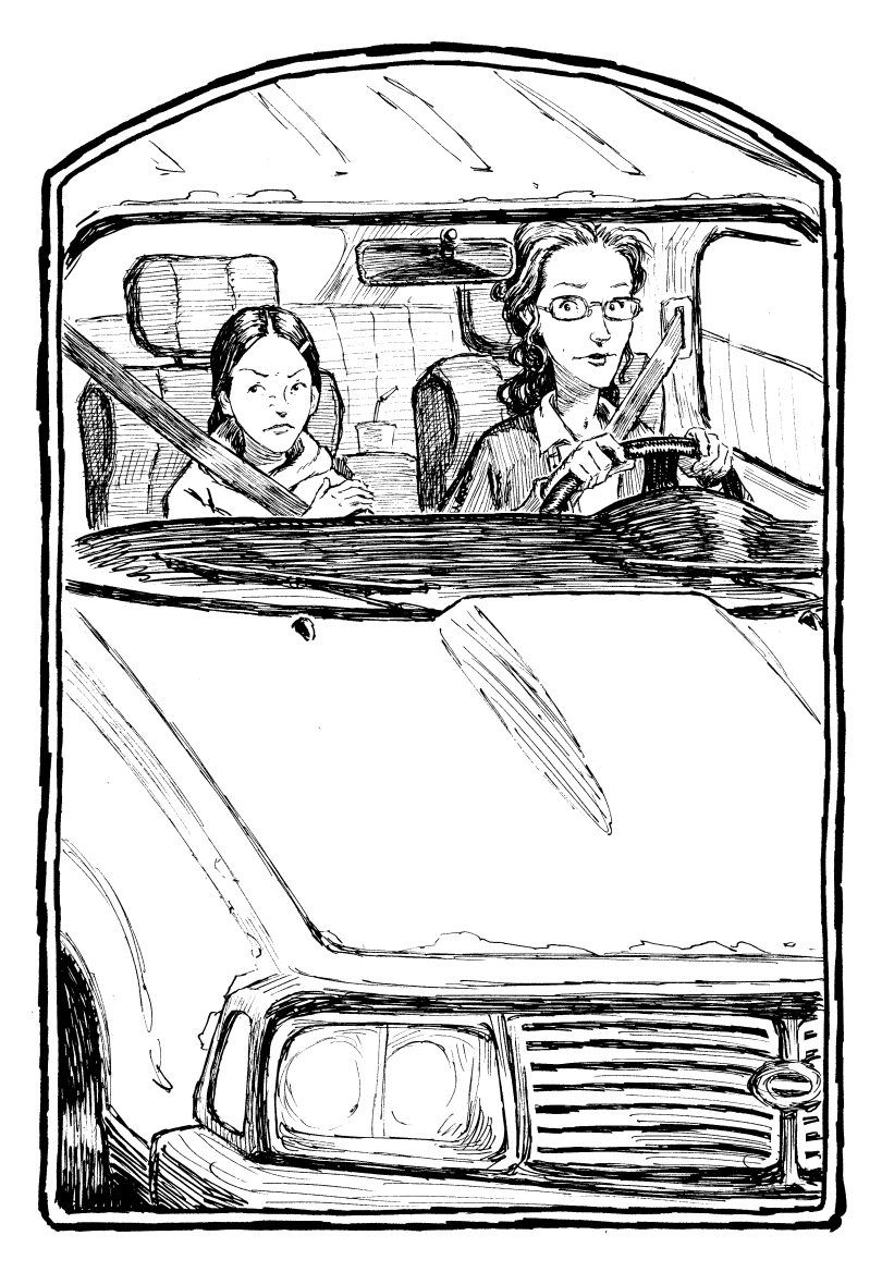
"I bet he liker you."