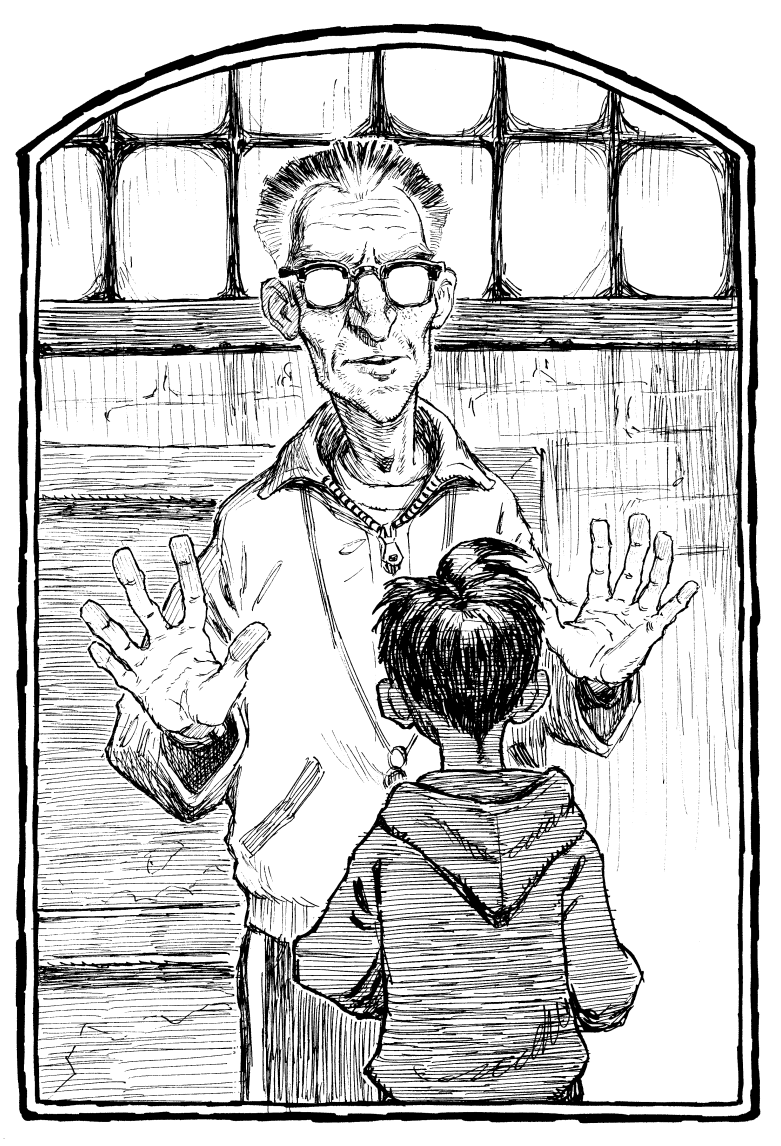
The coach stopped him.