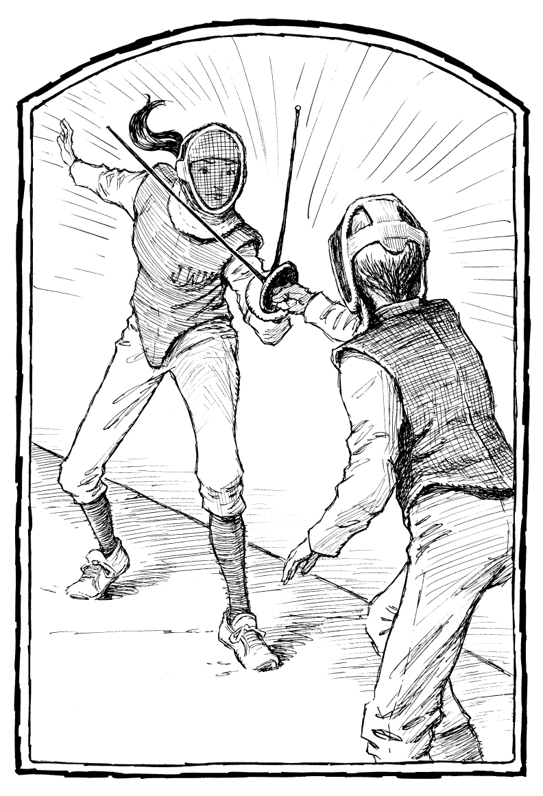
Clang of thin metal blades