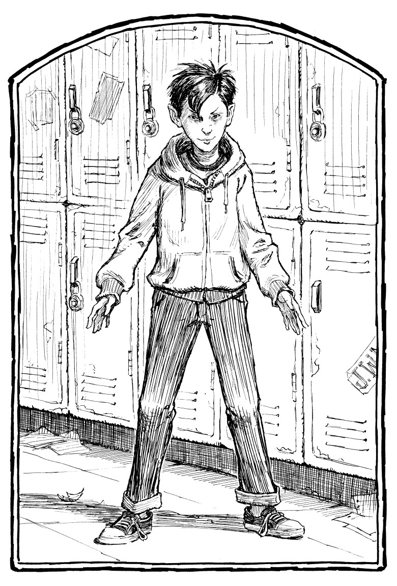
"Don't you know me?"