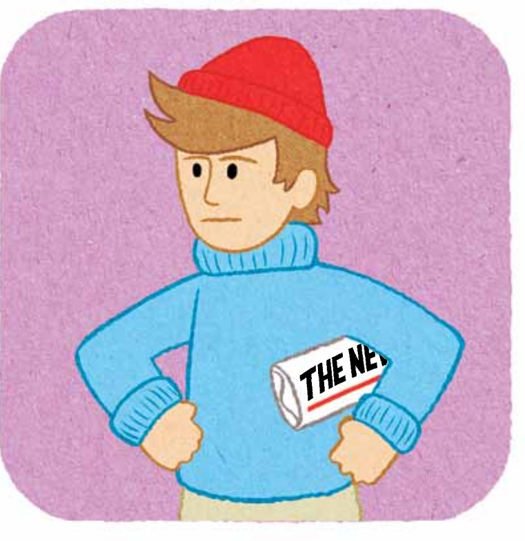
Tom resolved there and then to go and rescue him.