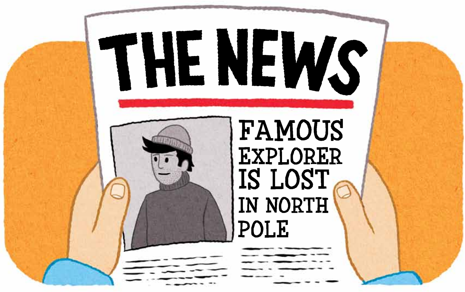
he was shocked to see a picture of his dad on the front of the morning paper.