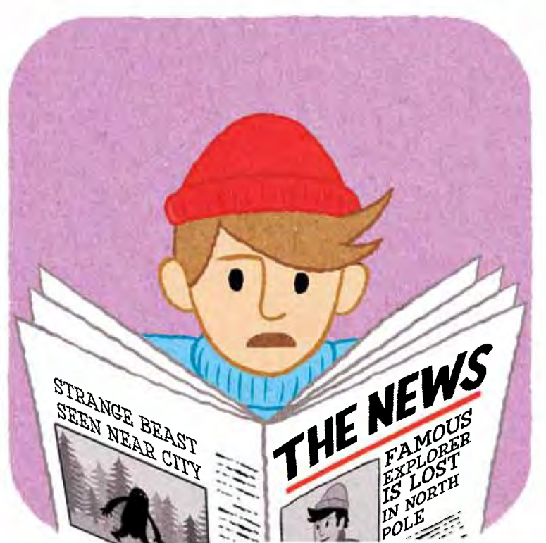
His dad had got lost while exploring the North Pole.