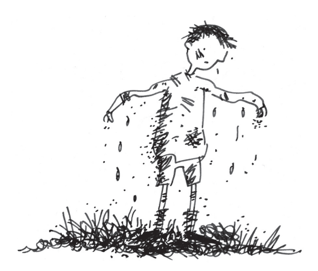
What did the pitch say to the player? 'I hate it when people treat me like dirt.'

What's the difference between the Prince of Wales and a throw-in? One's heir to the throne; the other's thrown to the air.