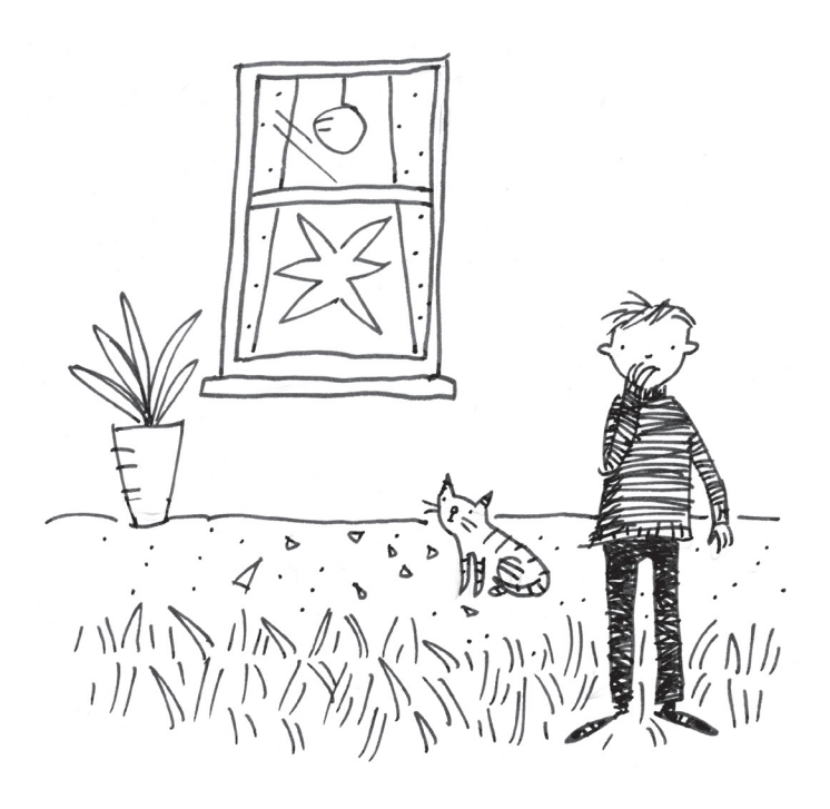
DAD: How did this window get broken? TOMMY: Er, my football took a shot at goal while I was cleaning it.

Young Alec came off the pitch looking very dejected and slunk into the dressing room. 'I've never played so badly before,' he sighed. 'Oh,' answered a fellow player. 'You've played before, have you?'